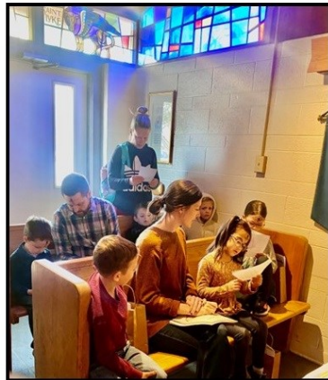
Children's Ash Wednesday Service